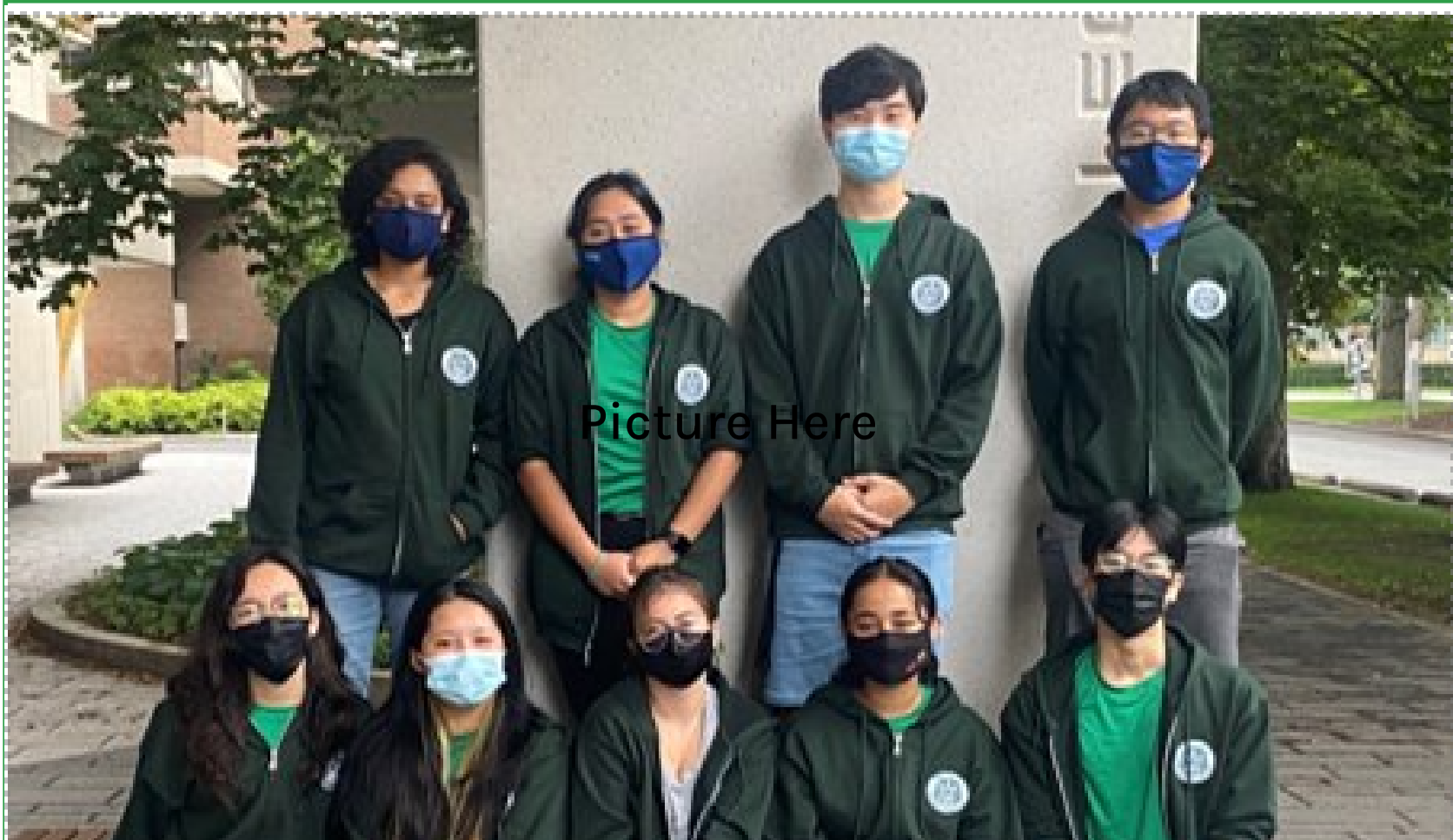
Learning eXperience Assistants